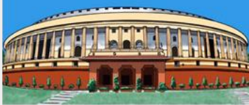
Biological Diversity (Amendment) Bill, 2021

On July 25, the Lok Sabha passed the Biological Diversity (Amendment) Bill, 2021 amidst Opposition demands for PM's statement on Manipur violence.